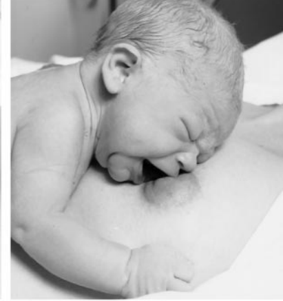
Fig 1. An infant boy <1 hour old crawls up his mother's body and latches onto her breast by himself, clockwise from left.